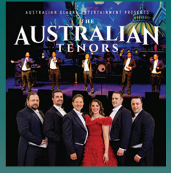
The Australian Tenors Sunday 22 June, 2pm