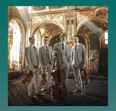
The Orava Quartet plays Beethoven Sunday 10 August, 4pm